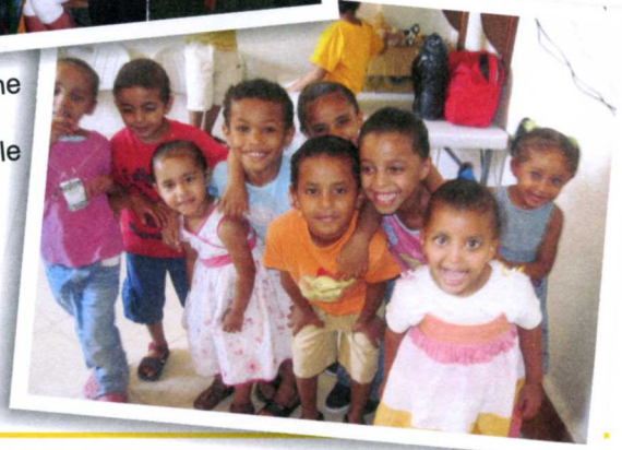
Hello from the children at SunShine