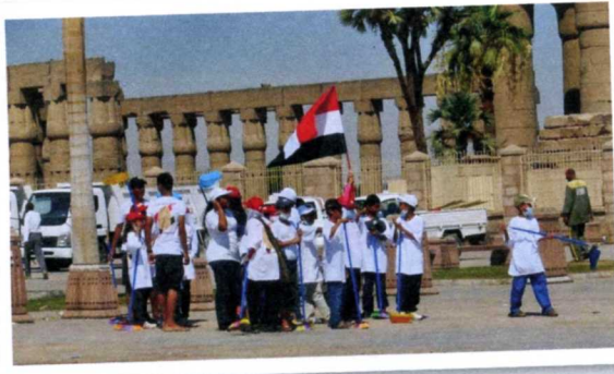
Brushes at the ready!

A campaign was launched in spring, by the new Governor of Luxor, to clean up the streets of Luxor. Many local schoolchildren assisted in the clean-up, and true to form, our children were amongst the first to offer to help out.