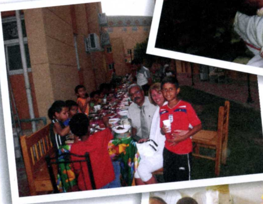
Breaking fast with the family at SunShine was an unforgettable experience